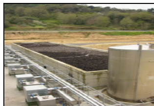
Figure 4. Example of bio-filtration at European MBT plant