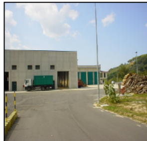
Figure 2. Example of European MBT plant