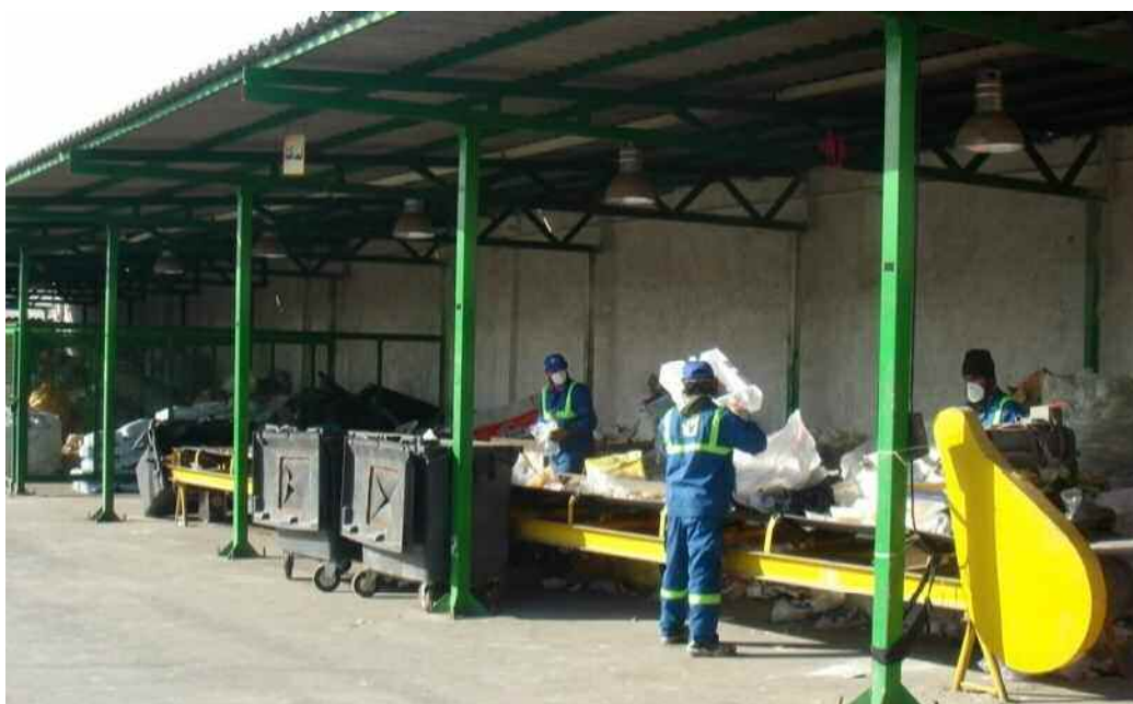
Figure 3: Sorting Line in Recovery Station of District 22

The collected plastic bags picked from households' door, are transported directly to the recovery station, where, they will be discharged in a room close to the conveyer. Bags are emptied on top of the conveyer belt, where they will be sorted. The whole process is performed manually. This process is depicted in Figure 3.