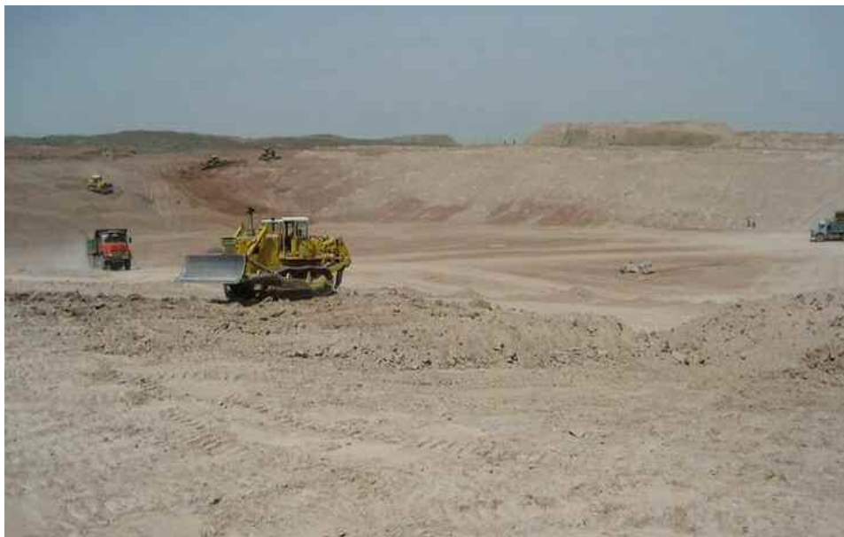
Figure 2: Tehran's new landfill