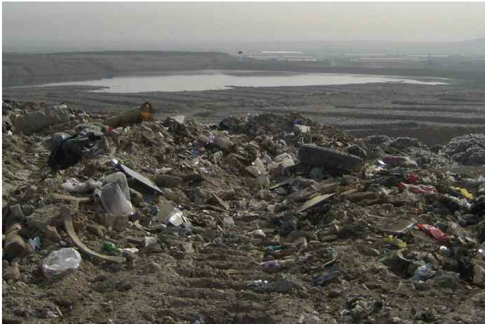
Figure 1: Tehran's old landfill